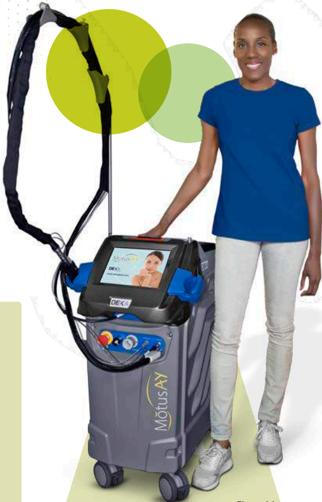
Fiona May Long Jump World Champion