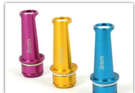
LUMINETTE Q interchangeable laser spot sizes

Cost-effective passive tattoo removal laser with an unrivalled clearance of tattoos, together with award-winning post-purchase support & service