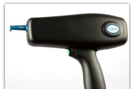
The 1064nm handpiece for treatment of black & dark blue ink pigments